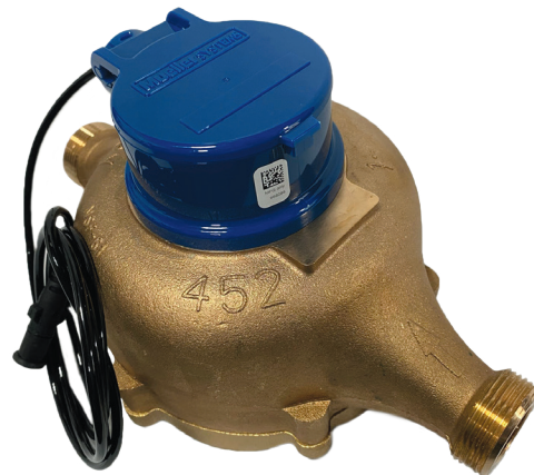
452 BRONZE PD METER WITH SSR EQUIPPED WITH 5' NICOR CABLE

The pad located at the top of the display is permanently etched with a unique, never duplicated 10-digit ID number, meter model, size, and the date of manufacture. A plastic lid protects the glass lens while usage and additional data are collected.