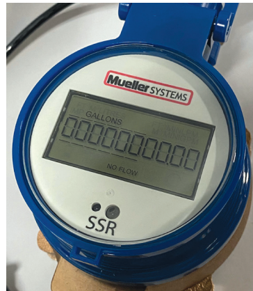
SOLID STATE REGISTER (SSR) §

The SSR register provides a lower profile than its electromechanical counterparts to make installation in small meter boxes easier. The SSR housing provides multiple options for integral AMR / AMI device mounting. Units integrated with the AMI / AMR device transceiver are equipped with a knuckled joint to allow adjustments of up to 90° from vertical.